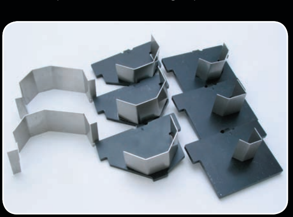
Container for mould ring