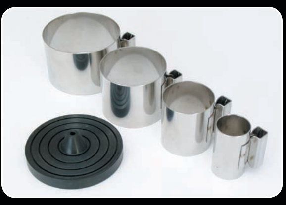
Mould ring Pi dental 1 set 4 pieces Rubber plate for mould ring 1 piece

Ceramic melting crucible 1 pack 6 pieces