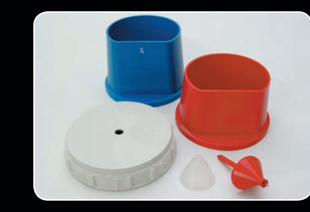
Plastic mould ring Dentaurum 1 set 3 pieces Cone + mould funnel with mandrel